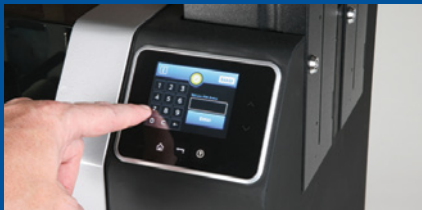
Industrial Card Printer